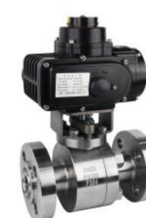
电动锻钢法兰球阀 Electric forged steel flange ball valve