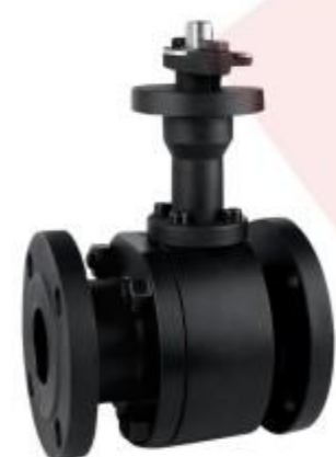
锻钢二片式法兰球阀 Forged steel 2PC flange ball valve