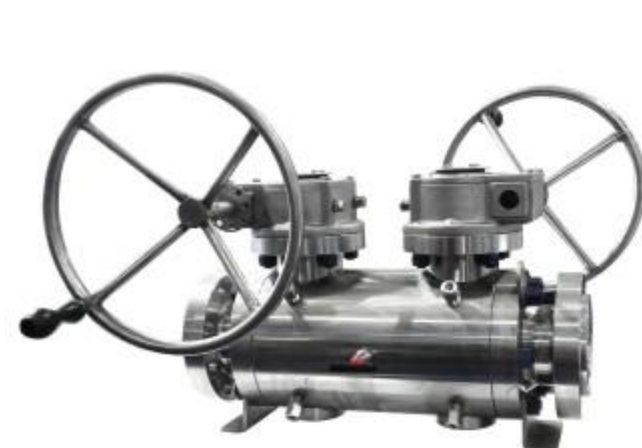
锻造双球球阀 Forged double ball valve