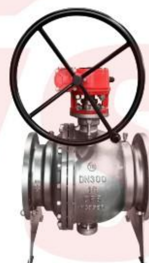
蜗轮固定式不锈钢法兰球阀 Worm fixed stainless steel flange ball valve