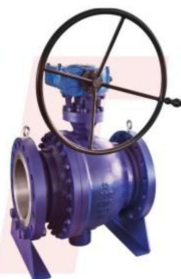
涡轮固定式硬密封球阀 Turbine fixed hard seal ball valve