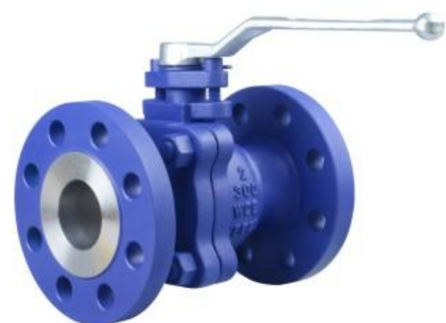
美标法兰球阀 American standard flange ball valve