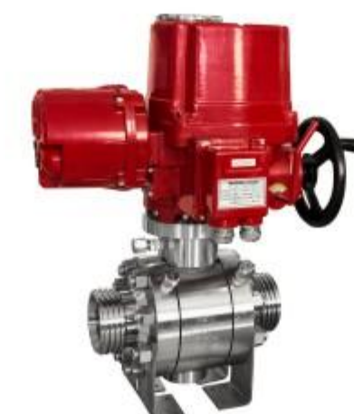
电动锻钢由壬球阀 Electric forged steel union ball valve