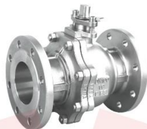
国标法兰球阀 National standard flange ball valve