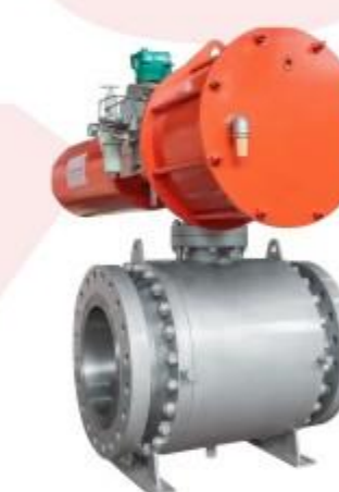
气动锻钢法兰球阀 Pneumatic forged steel flange ball valve