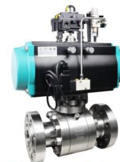
气动锻钢法兰球阀 Pneumatic forged steel flange ball valve