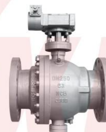
蜗轮固定式硬密封法兰球阀 Worm fixed hard seal flange ball valve