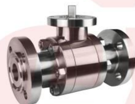
锻钢三片式法兰球阀 Forged steel 3PC flange ball valve