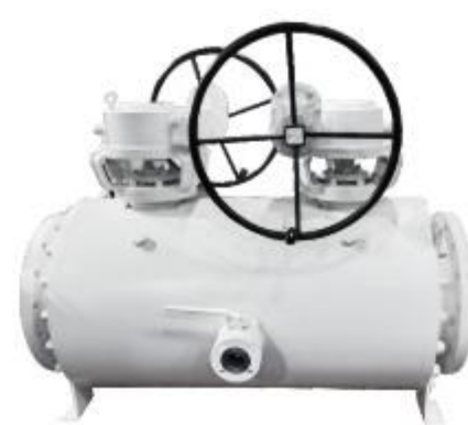
锻造双球球阀 Forged double ball valve