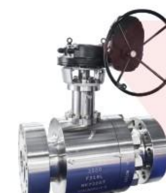
大口径高压低温锻钢法兰球阀 Large caliber high-pressure low-temperature forged steel flange ball valve