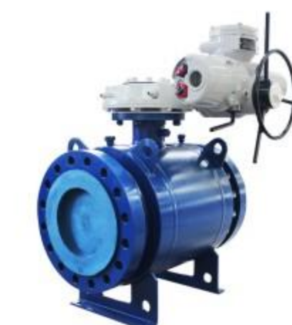
电动锻钢法兰球阀 Electric forged steel flange ball valve