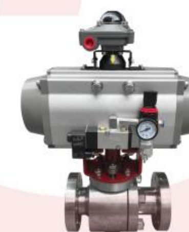
气动锻钢法兰球阀 Pneumatic forged steel flange ball valve