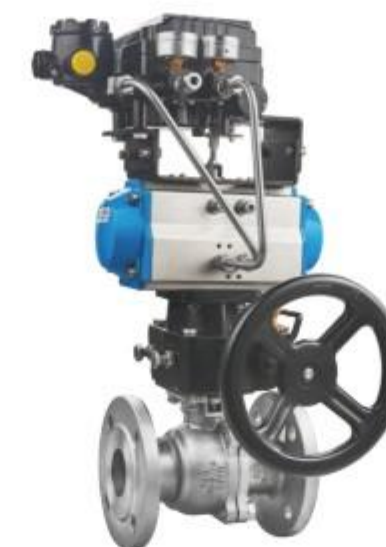
气动法兰球阀 Pneumatic flange ball valve