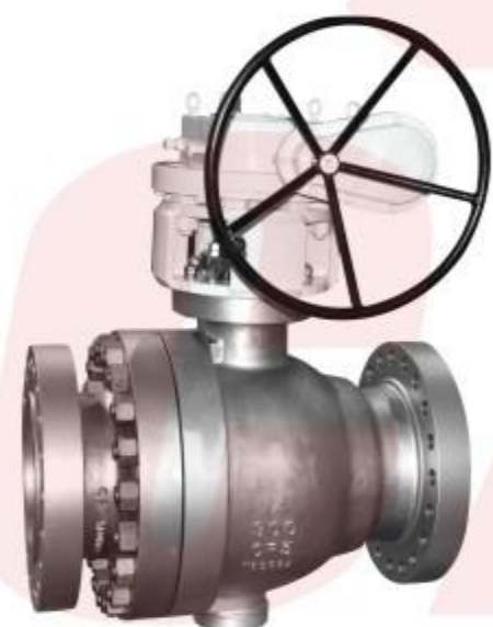
高压硬密封固定式法兰球阀 High pressure hard sealed fixed flange ball valve