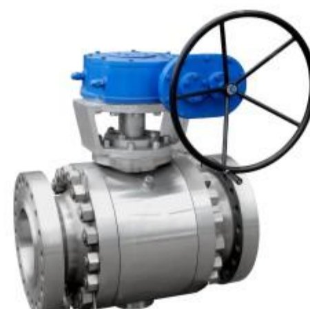
大口径锻钢三片式法兰球阀 Large diameter forged steel 3PC flange ball valve