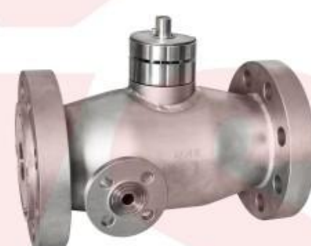
锻钢一体式保温法兰球阀 Forged steel integrated insulated flange ball valve