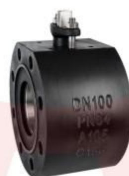
锻钢对夹球阀 Forged steel clamp ball valve