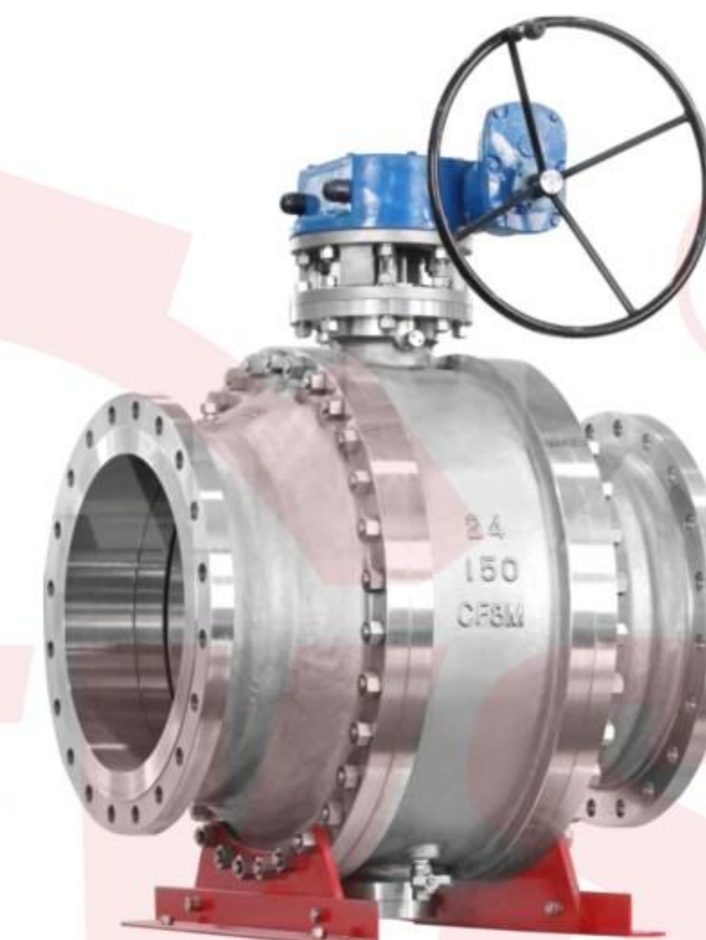
涡轮固定式硬密封法兰球阀 Turbine fixed hard seal flange ball valve