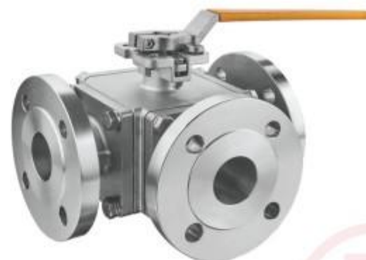
高平台三通法兰球阀 High platform three-way flange ball valve