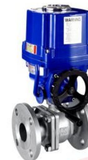
电动法兰球阀 Electric flange ball valve