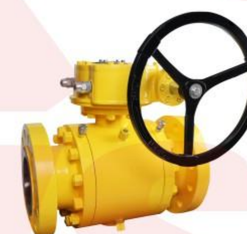
锻钢蜗轮三片式法兰球阀 Forged steel worm gear 3PC flange ball valve