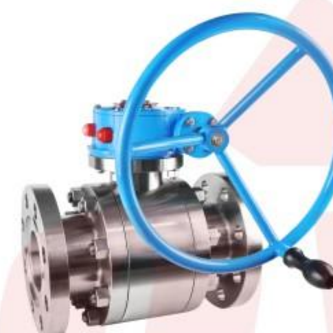
锻钢蜗轮三片式法兰球阀 Forged steel worm gear 3PC flange ball valve