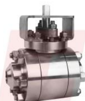
锻钢三片式对焊球阀 Forged steel 3PC flange ball valve