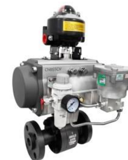
气动锻钢法兰球阀 Pneumatic forged steel flange ball valve