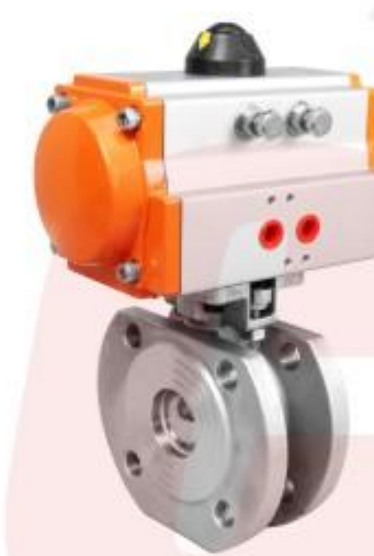
气动对夹式法兰球阀 Pneumatic wafer type flange ball valve