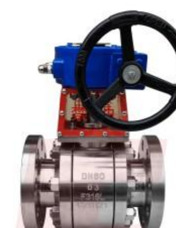
锻钢氧气法兰球阀 Forged steel oxygen flange ball valve