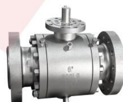
锻钢三片式高压法兰球阀 Forged steel 3PC high-pressure flange ball valve